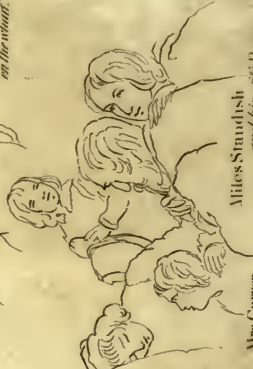
Miles Standish and his wife Rose.